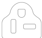
Power cord with plug (NEMA 6-20P)

LAUDA DR. R. WOBSEY GMBH & CO. KG Laudaplatz 1 • 97922 Lauda-Königshofen • DE