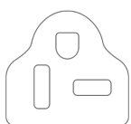
Power cord with plug (NEMA 6-20P)

LAUDA Variocool VC 2000 W Process thermostat 208-220 V; 60 Hz Part Number: L004361