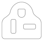
Power cord with plug (NEMA 6-20P)