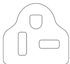
Power cord with plug (NEMA 6-20P)

LAUDA DR. R. WOBSEY GMBH & CO. KG Laudaplatz 1 • 97922 Lauda-Königshofen • DE