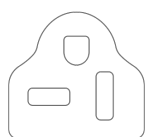
Power cord with plug (NEMA 5-20P)