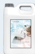
Heat transfer liquids