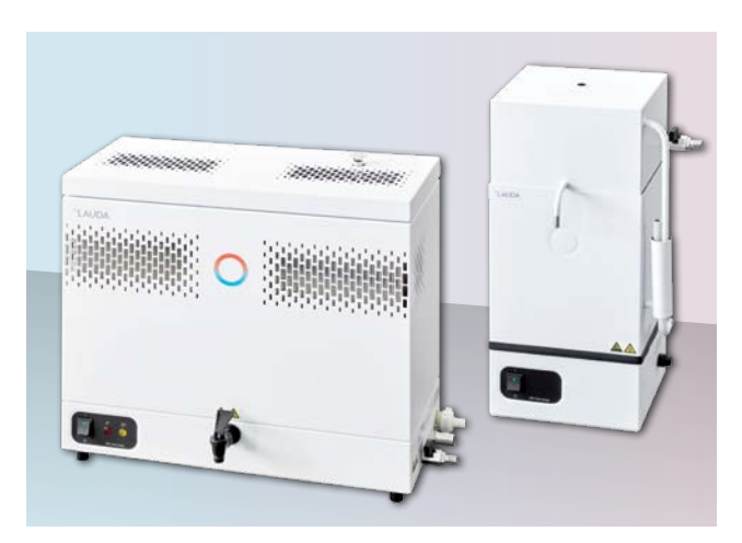
Equipped for any application: Puridest PD 4\ R with an internal storage tank and PD 2 for direct distillate extraction

Commissioning and operation of the stills are extremely simple. Ultra-pure water can be extracted directly after connection to the raw water and power supply. The only maintenance required is removing pollutants from the still. Dispensing with complex service work and cleaning as well as the repeated procurement of consumables makes LAUDA Puridest a simple and reliable solution that can be used anywhere in the world.