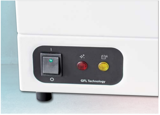
Our maxim is simplicity: LED indicators for operating status and cleaning requirement are equipped as standard